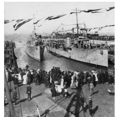
HMS Yarra (left) and Parramatta arriving at Alfred Graving Dock, Williamstown, 10 December 1910